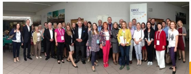
Some of the delegates of the 5th Annual EMCC Mentoring and Coaching Research Conference

The book of the proceedings of the conference is being prepared as this newsletter goes to press and should be available before end July from our online bookstore www.EMCCbooks.org . We'll be letting members know when it's in stock.